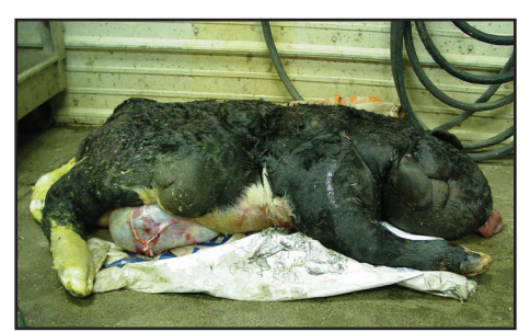
Pulmonary hypoplasia with anasarca (PHA)

DNA test: AgriGenomics, Igenity, Pfizer (NOTE: Does test for both the Improver and Outcast deletions.)