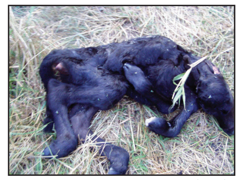
Arthrogryposis multiplex (AM) Calf born dead with AM. Not the severely twisted legs and spine.

What is it? A lethal autosomal recessive genetic defect